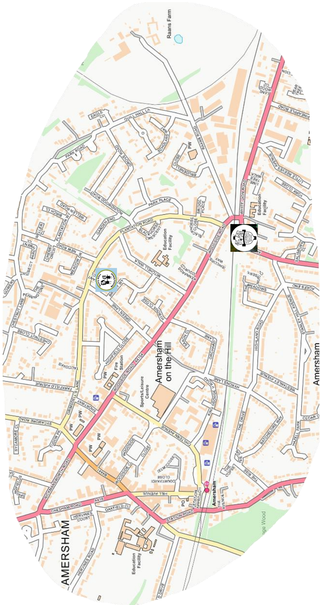
A map showing the limits of the local learning area.